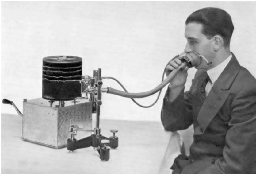
Figure 2. Edward Wheeler Scripture's kymograph, which took simultaneous recordings from the nose and mouth. Reprinted with permission from E. W. Scripture, "Registration of Speech Sounds," Journal of the Acoustical Society of America 7 (1935): 140. Copyright 1935, Acoustical Society of America.

the gestures of speech organs "wrote themselves," with some measure of control and replicability (figure 2). 30